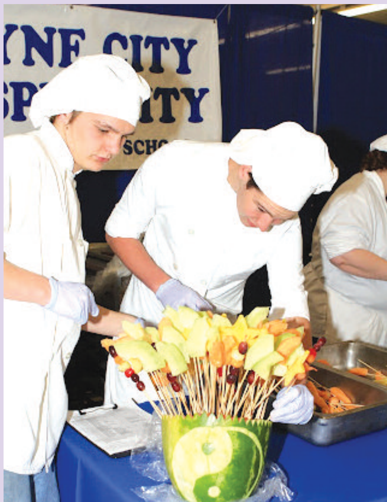
Boyne Community High School's Team Hospitality will be among the 12 area eateries that will be on hand this year at the 4th Annual Business Expo and Taste of Boyne event.

Taste of Boyne food and beverage vendors this year, each of which will be offering tasting samplings, will include; - The BBQ - BC Pizza - Boyne Community High