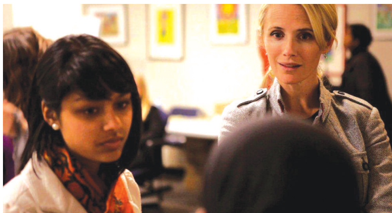
Jennifer Siebel Newsom (right) who wrote, directed and produced the documentary, Miss Representation, is shown on the set during filming.

Miss Representation includes stories from teenage girls and provocative interviews with politicians, journalists, entertainers, activists and academics like Condoleezza Rice, Lisa Ling, Nancy Pelosi, Katie Couric,