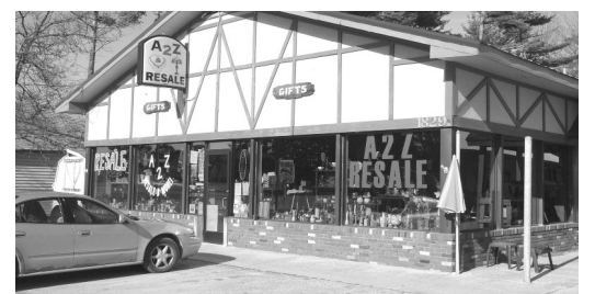
A-2-Z Resale is located at 1829 Old 27 South (S. Otsego Avenue) in Gaylord. The store is open from 9 am to 6 pm, seven days a week all year long with the exception of holidays.

A-2-Z Resale is located at 1829 Old 27 South (S. Otsego Avenue) in Gaylord. The store is open from 9 am to 6 pm, seven days a week all year long with the exception of holidays. For additional information call (989) 732-9500.