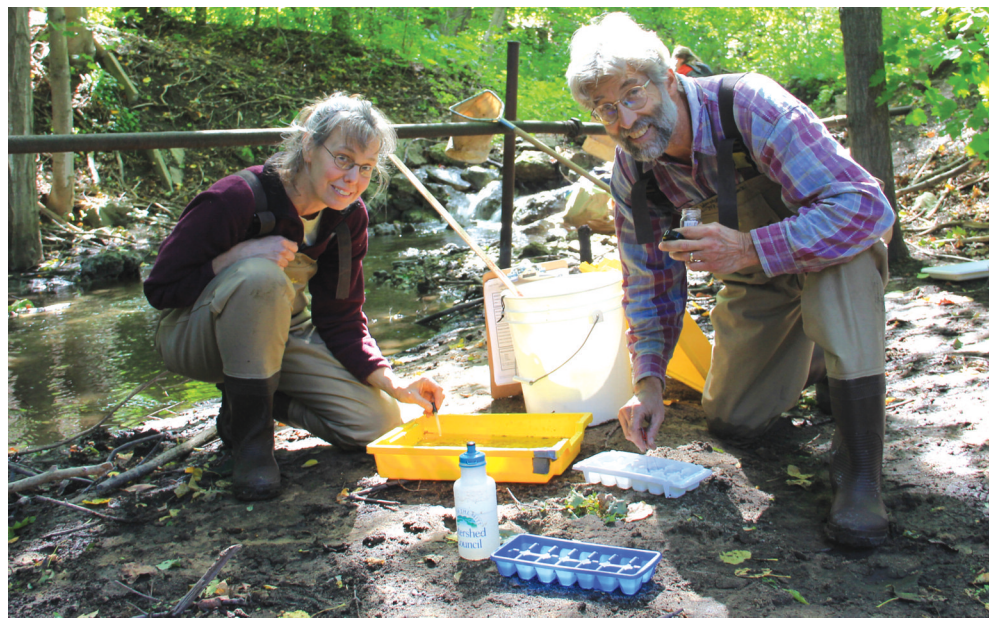
Volunteers are needed for the Tip of the Mitt Watershed Council Volunteer Stream Monitoring program events; out on the streams on Saturday, May 19 and in the lab on Sunday, June 3.